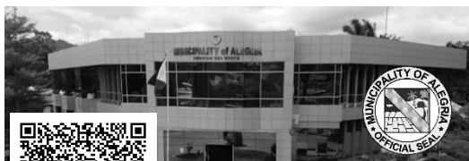
Municipality of Alegria Province of Surigao del Norte Office of the Municipal Mayor Executive Order No. 96 s. 2020